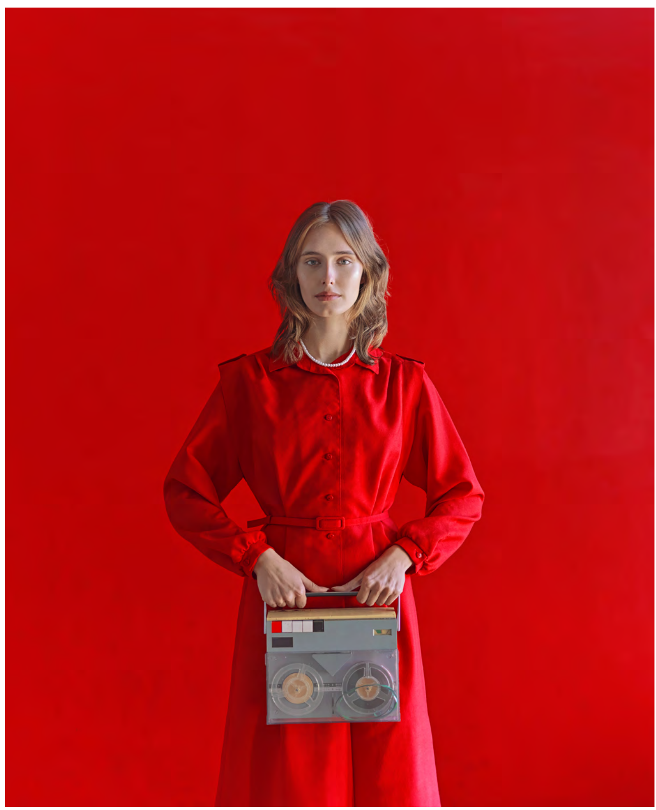
COVER: © MÁRIA ŠVARBOVÁ FOR THE TEAM OF CITÉ RADIEUSE, WITH THE KIND AUTHORIZATION OF LE CORBUSIER FOUNDATION © FLC I ADAGP PARIS